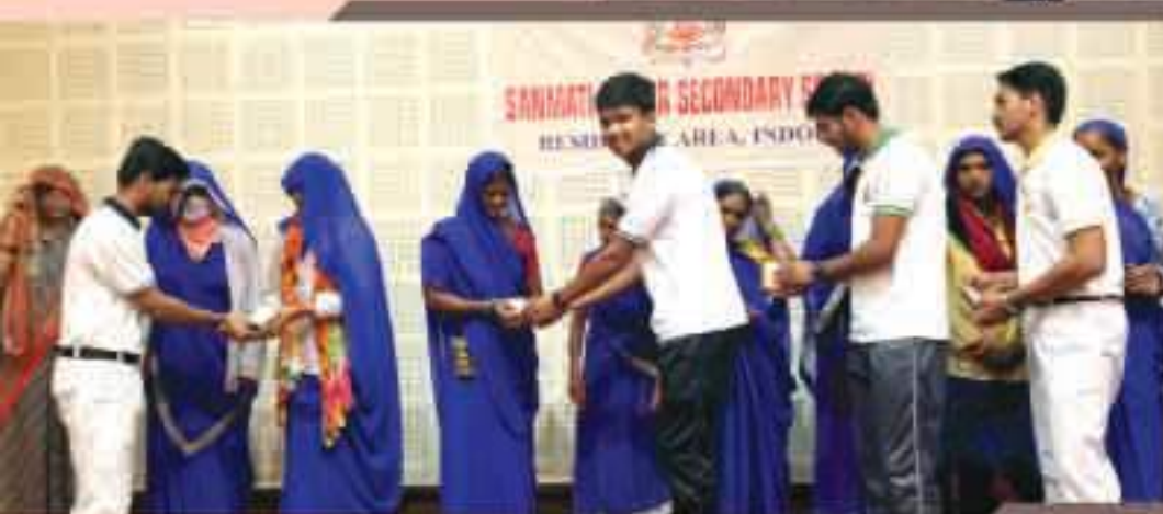
Felicitating the Nagar Nigam Employees for making Indore No. 1 In Cleanliness