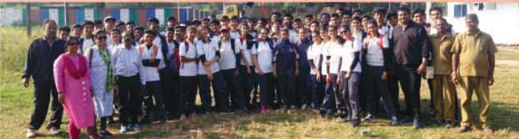
Bicycle Expedition to Ralamandal