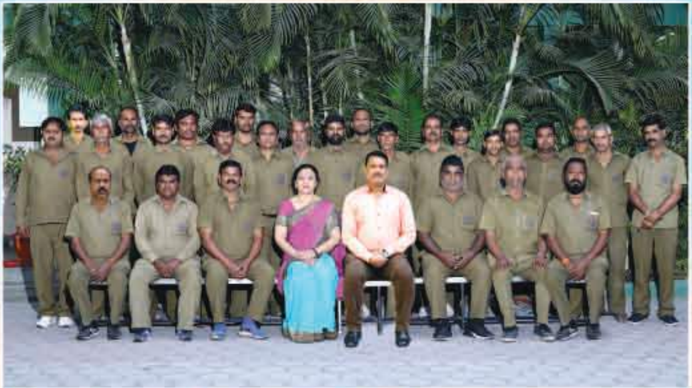
SERVICE ON WHEELS - TRANSPORT STAFF