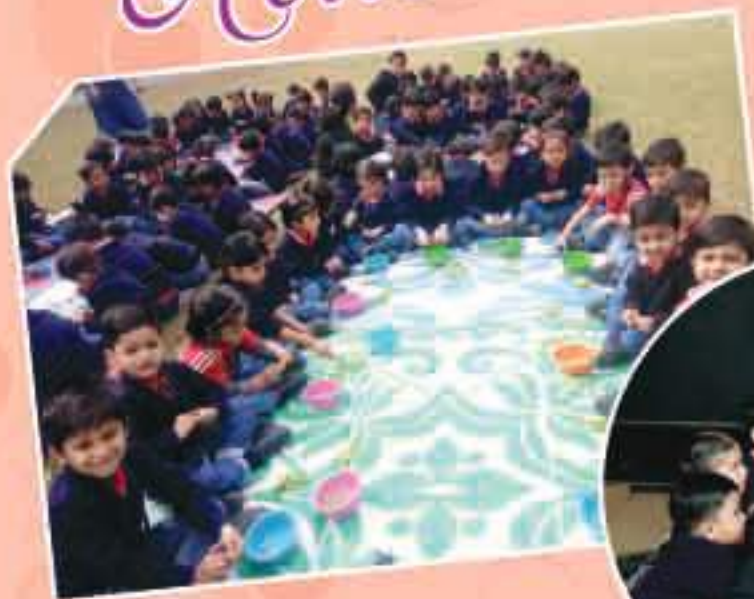
Shelling of Peas