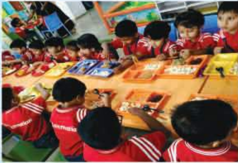
Visit to Club House