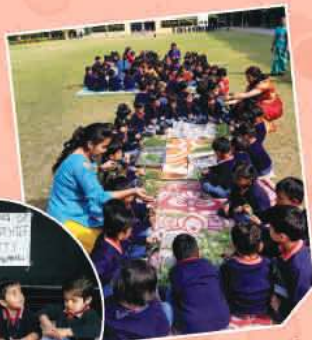
Plucking of Fenugreek Leaves