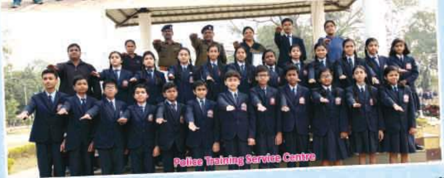
Police Training Service Centre