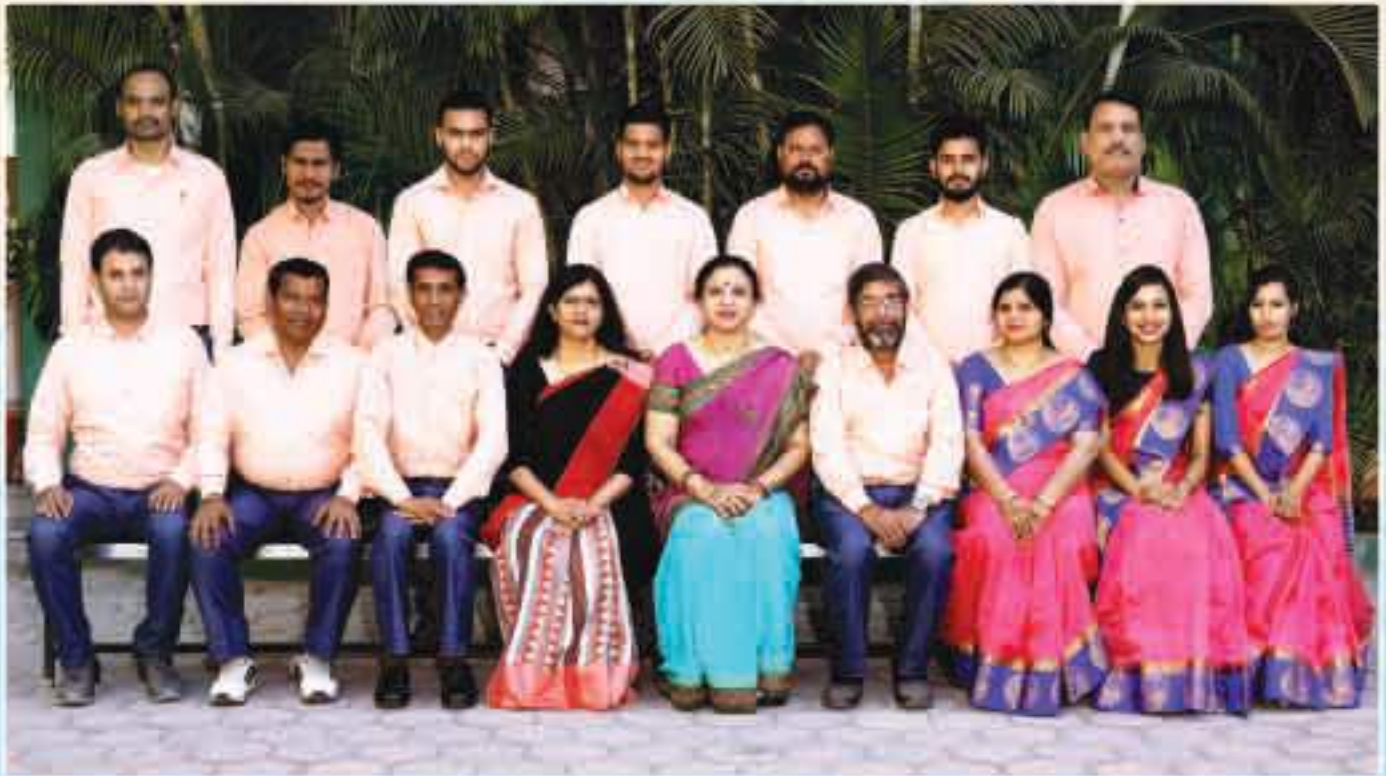
THE SUPPORTING SPINE - ADMINISTRATIVE STAFF