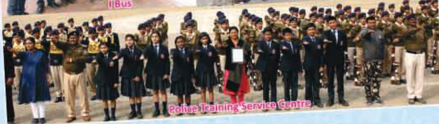
Police Training Service Centre