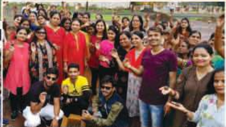
Sowing Seed Balls