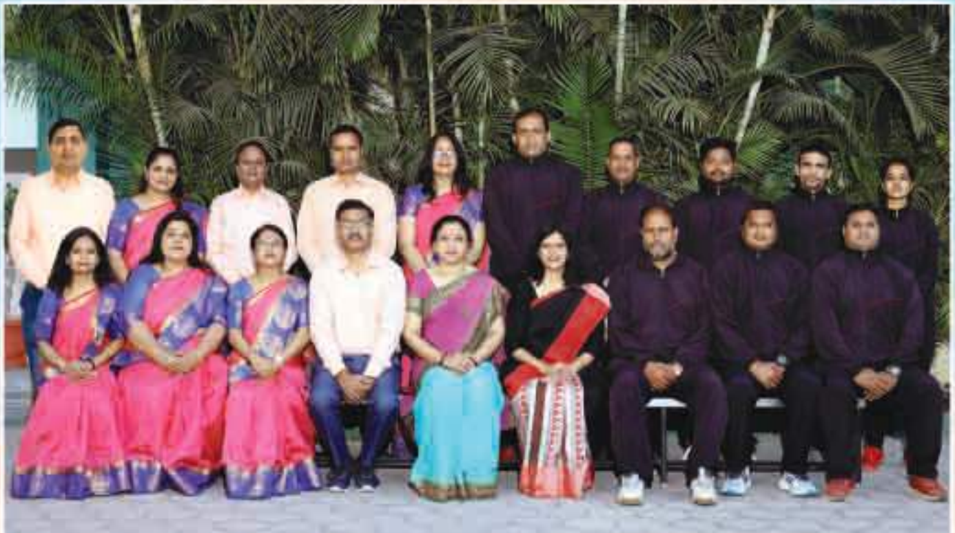
THE TALENT INSPIRERS - ACTIVITY STAFF