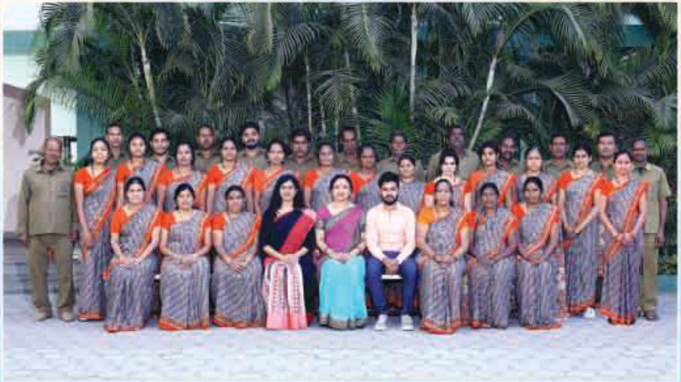
THE FLAG BEARERS OF CLEANLINESS - HOUSEKEEPING STAFF