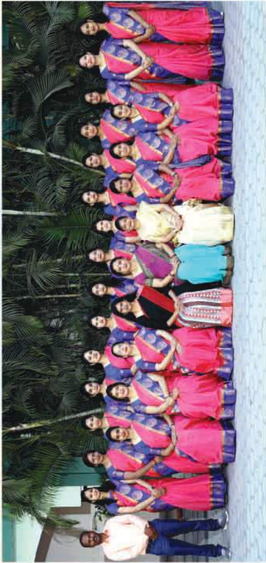
MAGNIFIERS OF THE CAPABILITY - MIDDLE WING STAFF