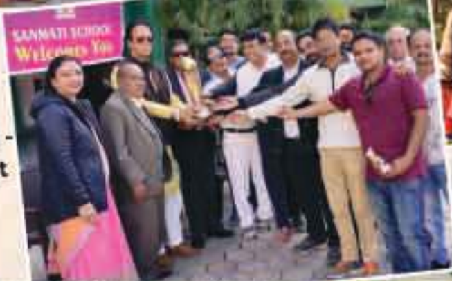
Enjoying togetherness @ Siddhawarkoot