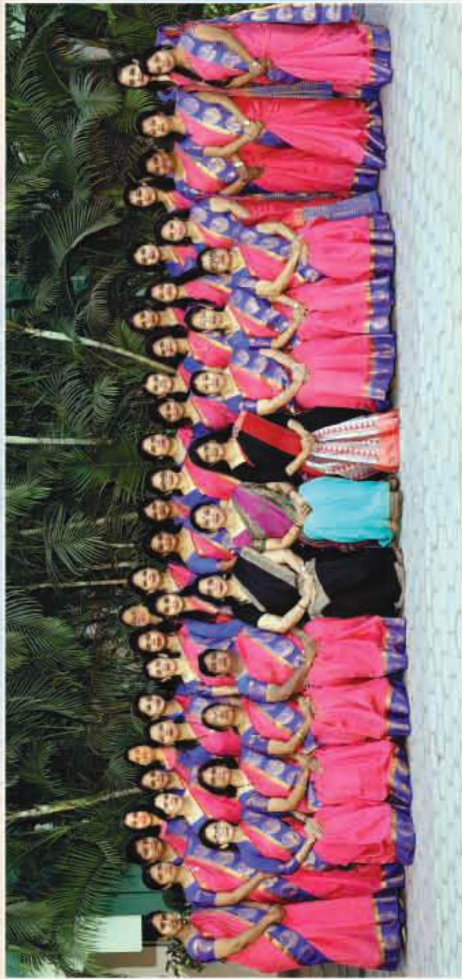
DISCOVERERS OF TALENT & POTENTIAL - JUNIOR WING STAFF