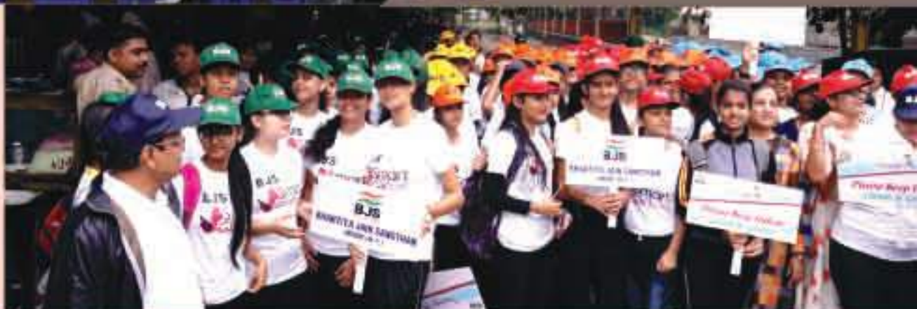
BJS - Girls' Empowerment Run