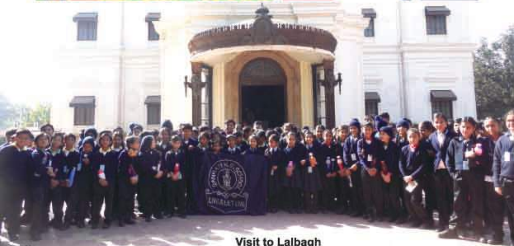
Visit to Lalbagh