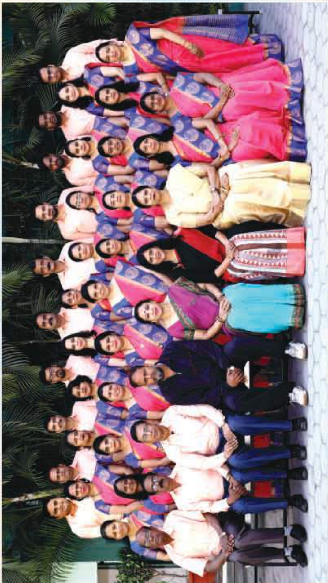
SHAPERS OF DREAMS INTO REALITY - SENIOR WING STAFF